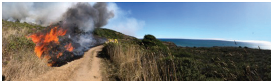
Woodward Fire, Pt Reyes

we are fortunate to be bordered in part by the ocean a fire on Mt Tam or on the Panoramic Ridge could blow through the adjacent valleys very fast. This will mean that following