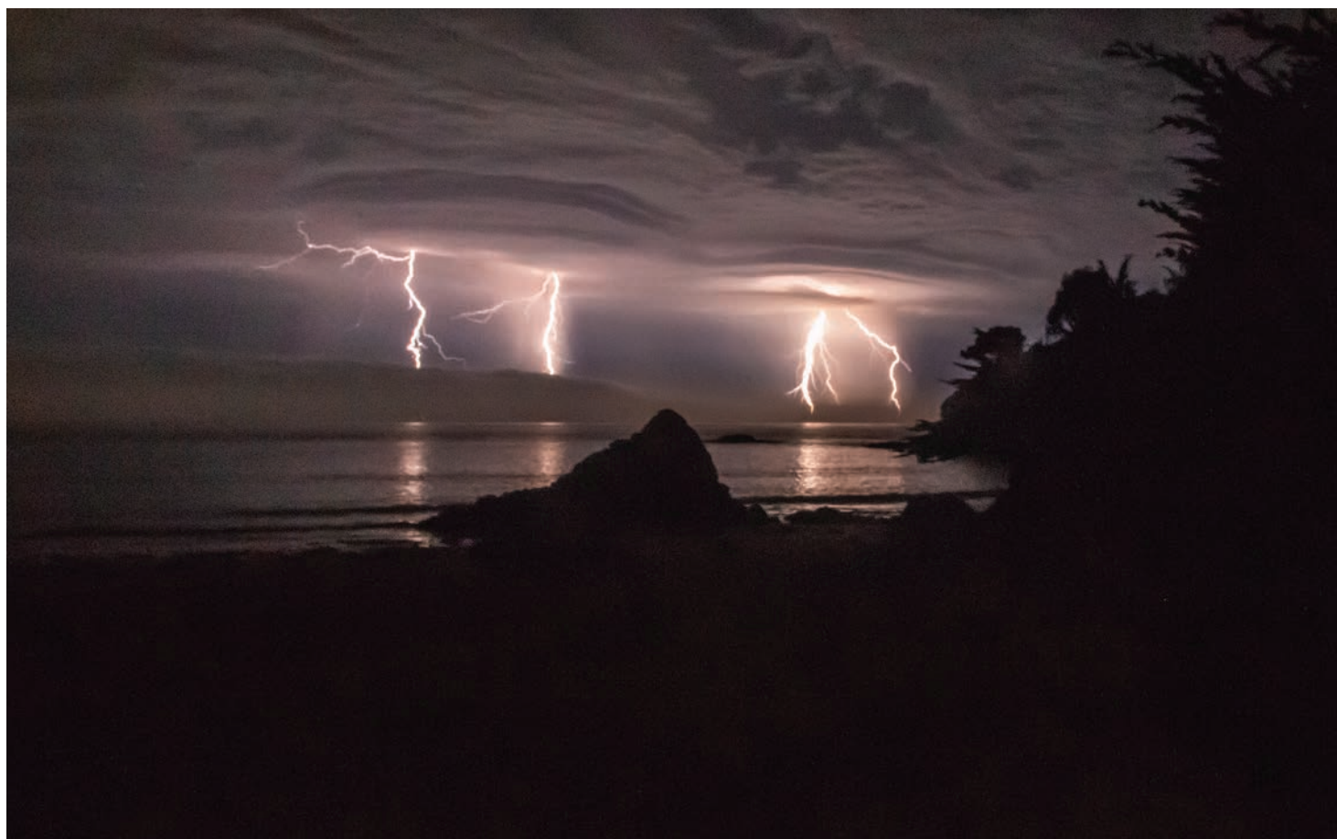
August 16, 2020 lightning storm.