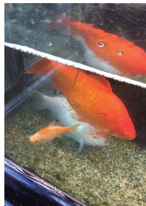
Tiny with her parents Poppy and Frosty.

The current MBVFD team continues to benefit from the wisdom and experience of our most distinguished alumni and we are all grateful for the work they are doing. The MBVFD and the surrounding fire brigades of MCFD, Southern Marin and Mill Valley along with the newly created Marin Wildfire Prevention Authority must continue to work together via mutual aid as a fire anywhere in Southern Marin is a risk for all of us.