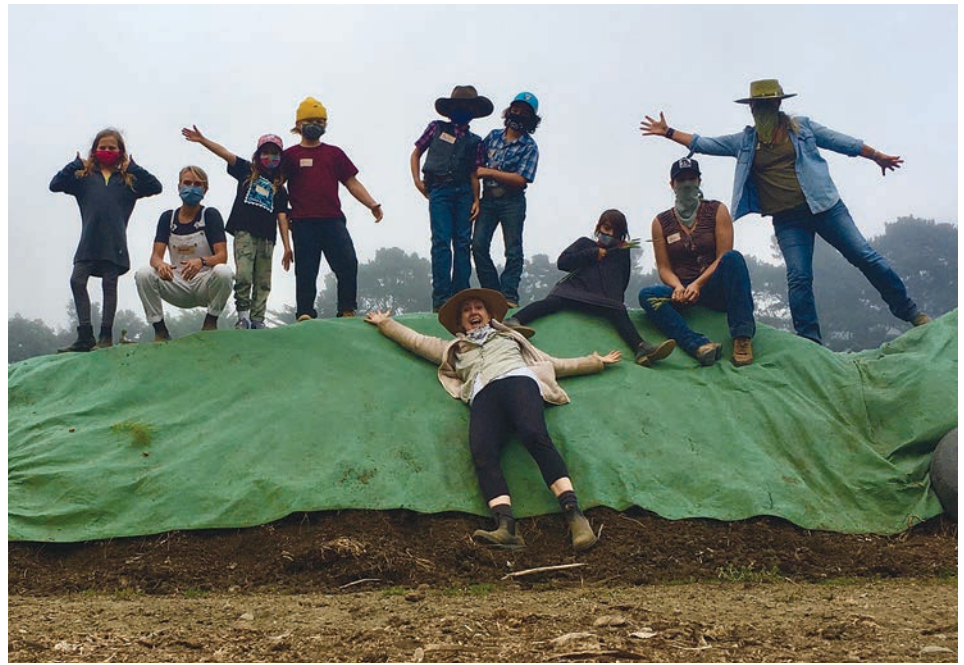
Marin Ranch School

In the meantime, like everyone else, we are practicing resiliency. We have had to pause on our regular Equine Facilitated Learning pro bono programs for underserved groups and our customized team development programs. However, two of our members have created Ranch School, an afternoon program for ages 10 – 12. Two afternoons per week, groups come to learn horse care, barn chores, social and life skills, all while having fun with their friends in nature and away from digital screens. Ranch School has been a hit and new groups will begin in the spring.